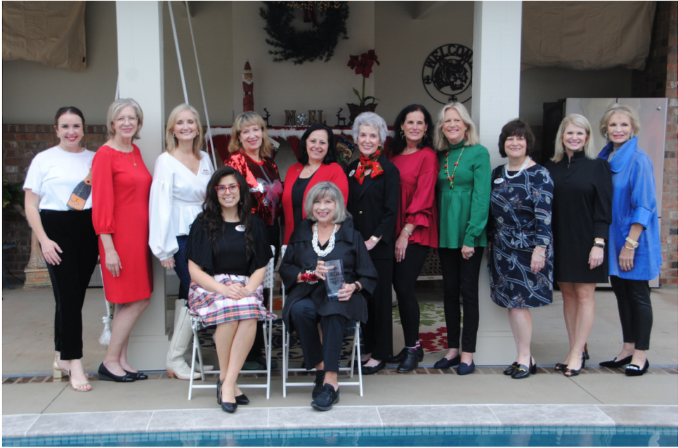
Former JLGC Presidents