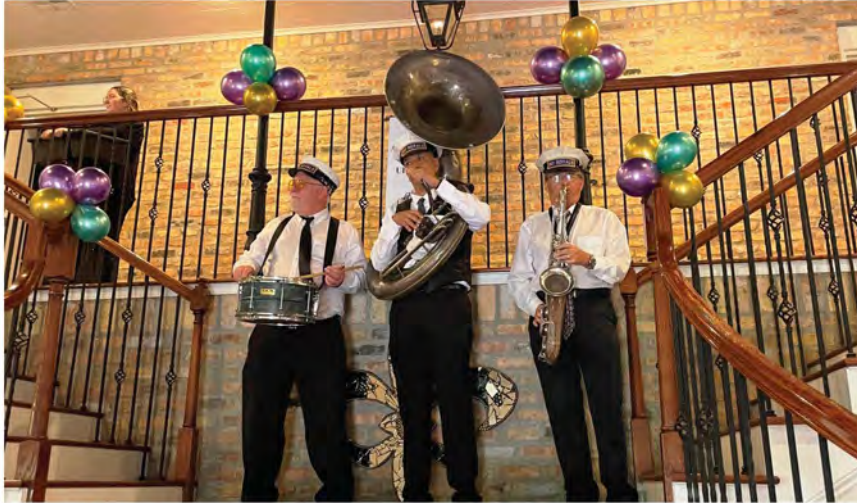
The 801 Brass Band welcomed revelers! Below: The Glitter Bar by Butterfly FX was a big hit!