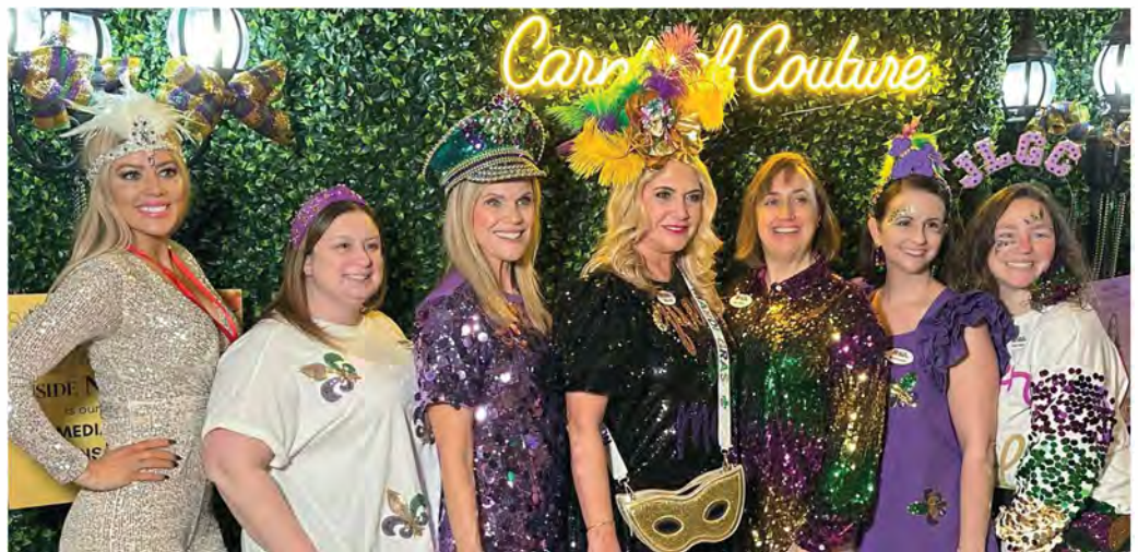
Thank you to our Carnival Couture Committee for their dedication to creating this amazing new event!