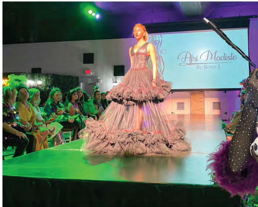
The show finale was a frothy tiered gown from Afri Modiste