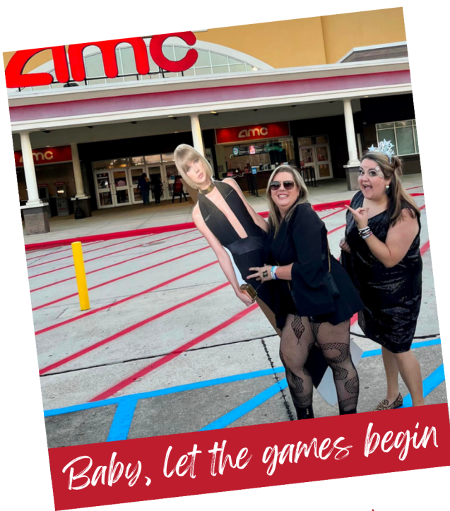
Baby, let the games begin