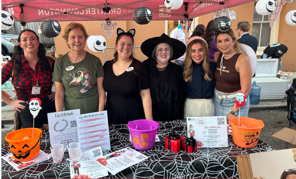
The real treat is the Sugar Plum Market!