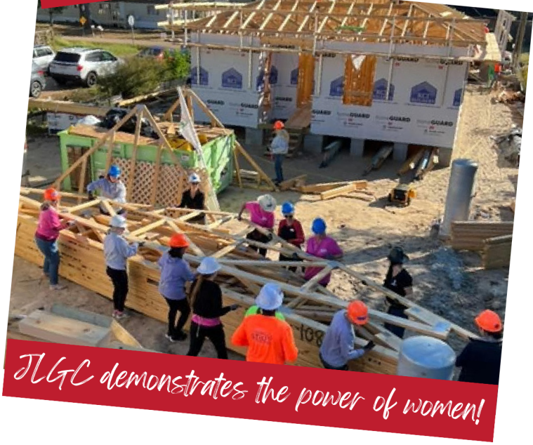
JLGC demonstrates the power of women!