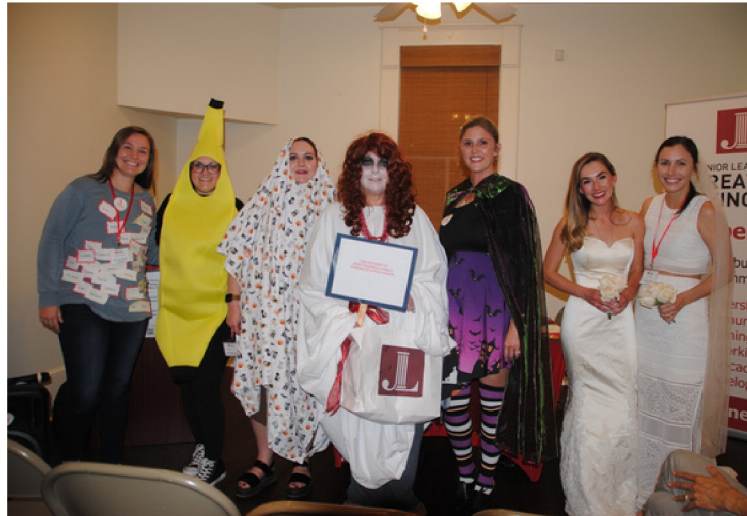
Thank you to all our spirited Provisional Class members who dressed for the occasion!