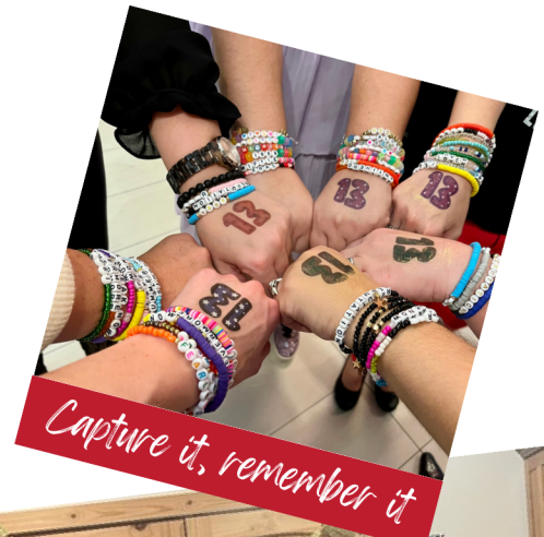
Capture it, remember it