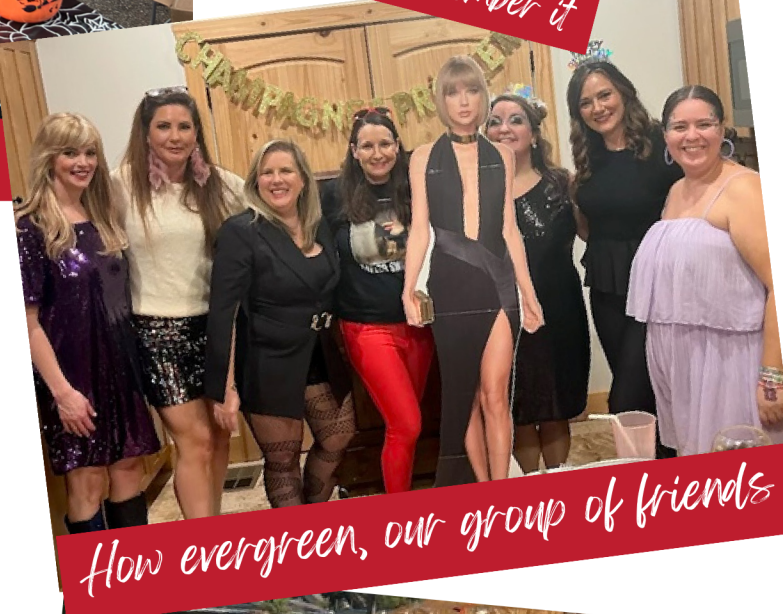
How evergreen, our group of friends