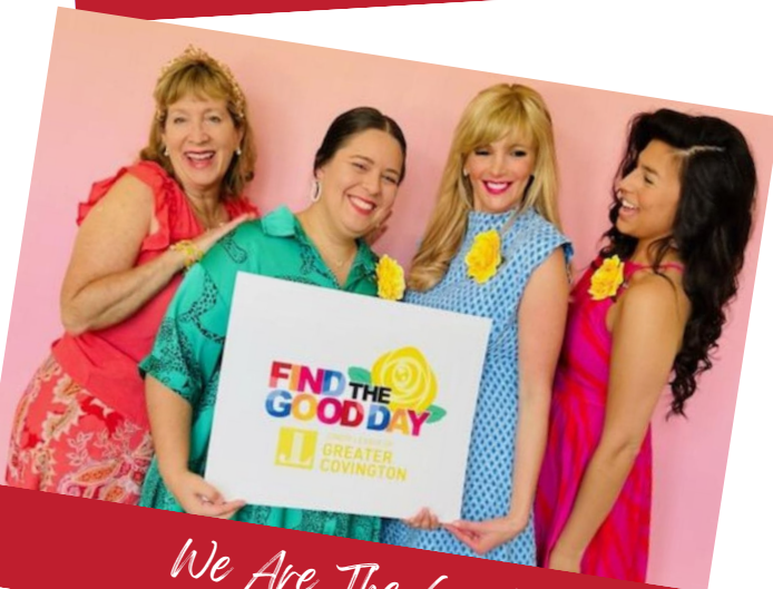
We Are The Good