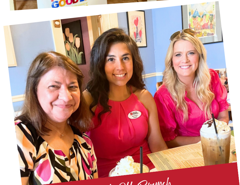
Kick Off Brunch